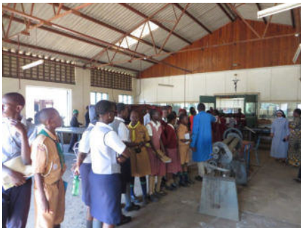
The Annual -Techno Expo 23 was

held on 13th October 2023. Many schools and parents visited the workshops and saw the products of Don Bosco Embu prepared by our students. Tough many schools promised to come they let us down by not appearing on the material day. However, we had close to 400 visitors on that day. The children from the neighbouring schools really marveled at the products. We thank the DBDON and DBTec Africa for the