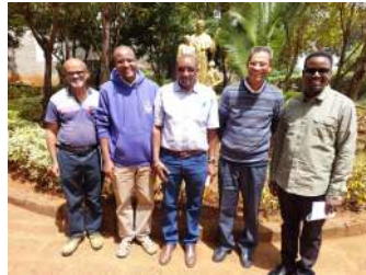
The visit of Don Bosco Embu restructure study commission