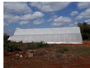
AITEC-Embu is taking shape.