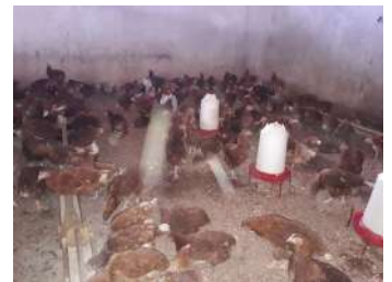
The timber & chickens