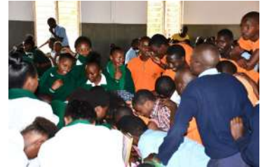
The members of Kenya Team

these teams. The ultimate winner was “Kenyatta Team”. The lunch of the day was sponsored by some generous people. Everyone enjoyed a lot and learned much concerning our new saint.